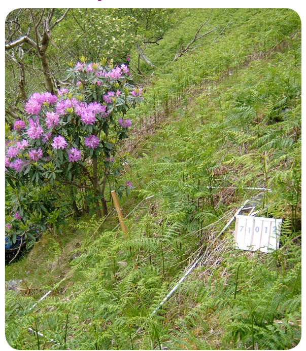
A woodland survey plot, Rhododendron and Bracken are typical invasive species.

Eric Birse and Jim Robertson surveyed and studied Scottish vegetation between 1945 and 1985, firstly under the auspices of the Macaulay Institute for Soil Research, and later as part of the Macaulay Land Use Research Institute. During this period they collected almost 7000 records of vegetation composition, many with accompanying soil profile information. The records cover all major Scottish vegetation types and were collected throughout Scotland. This information was subsequently used to develop a vegetation classification for Scotland, published as 'Plant communities of Scotland' in 1980