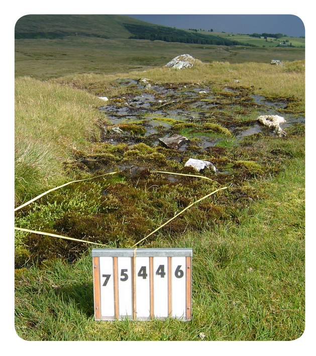
This mountain spring was first surveyed in 1975 and re-visited in 2008.